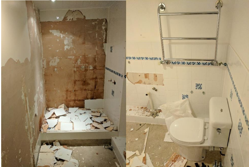
Bathroom day one.

Both the shower room and the WC were old and out of date, Trident stripped out all existing sanitary ware and tiles off the wall ready to install new flooring, sanitary ware and wall boarding.